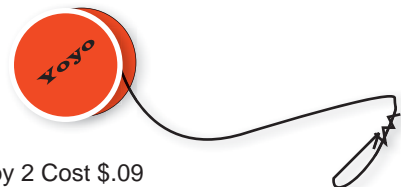
Toy 2 Cost $.09